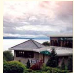
Queensferry Hotel North Queensferry KY11 1HP

10-13 Denham Grove NEW £299 Filming Weekend