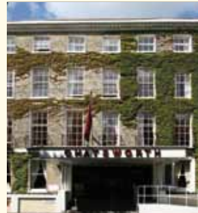
Chatsworth Hotel Worthing BN11 3DU