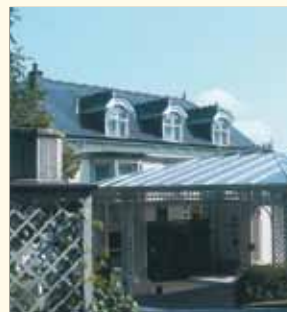
Blunsdon House Hotel Blunsdon, Swindon SN26 7AS

17-19 Chatsworth Hotel £245 Better Leads & Switches