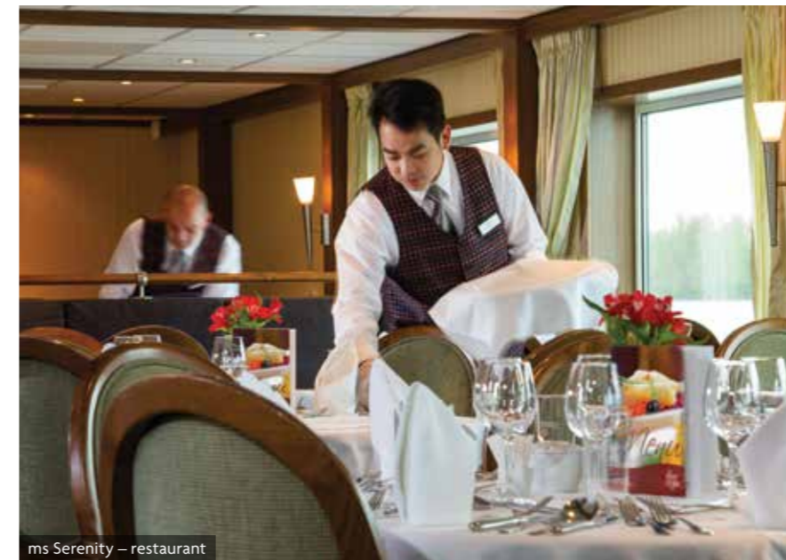
ms Serenity – restaurant

We spend a whole day in Vienna experiencing the delights of this beautiful city. In the morning you can join an optional city tour to experience its grand palaces, baroque castles, magnificent squares and striking monuments and after lunch on board we have an optional afternoon excursion to Schönbrunn Palace, or alternatively you may wish to join an afternoon bridge session. Enjoy evening bridge on board as we cast off and cruise towards Budapest.